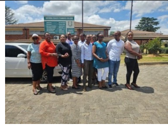
Scott College of Nursing

2. Starlight met nursing colleges in Lesotho in pursue to integrate Palliative care into the existing healthcare curricula.