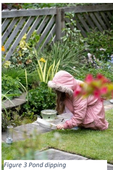
Figure 3 Pond dipping

To promote the conservation, maintenance and study of places and objects of botanical, zoological, geological, ecological or scientific interest in and around Menston and elsewhere by:-