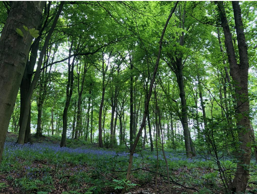
Figure 1 High Royds Woods