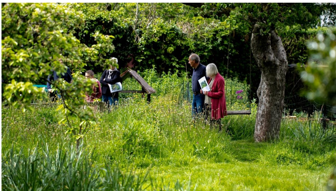
Figure 2 Wild Gardens Open Day May 2022