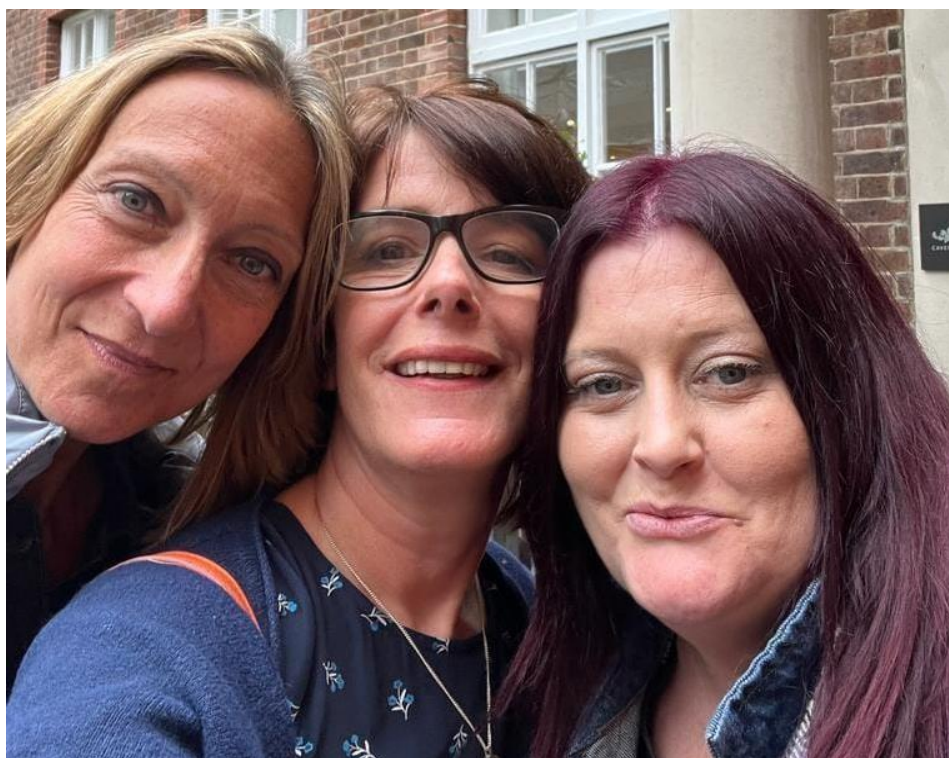
Aspirations Charity Shop