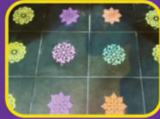
Give it a Go: Dance Like It's Diwali