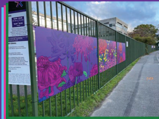
Mural, Crawley College