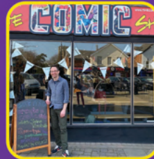
Give it a Go: Comic Book Strip