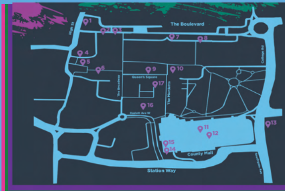
The Stories of Strength exhibition trail map

We also created a website where you can listen to all the stories (with subtitles) here .