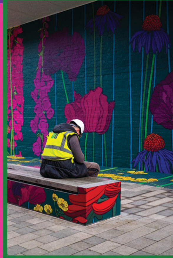
Mural in The Pavement, Crawley town centre

The artists also created displays outside Crawley College and tree, bench and bin wraps across the town centre that create a trail and are still in situ.