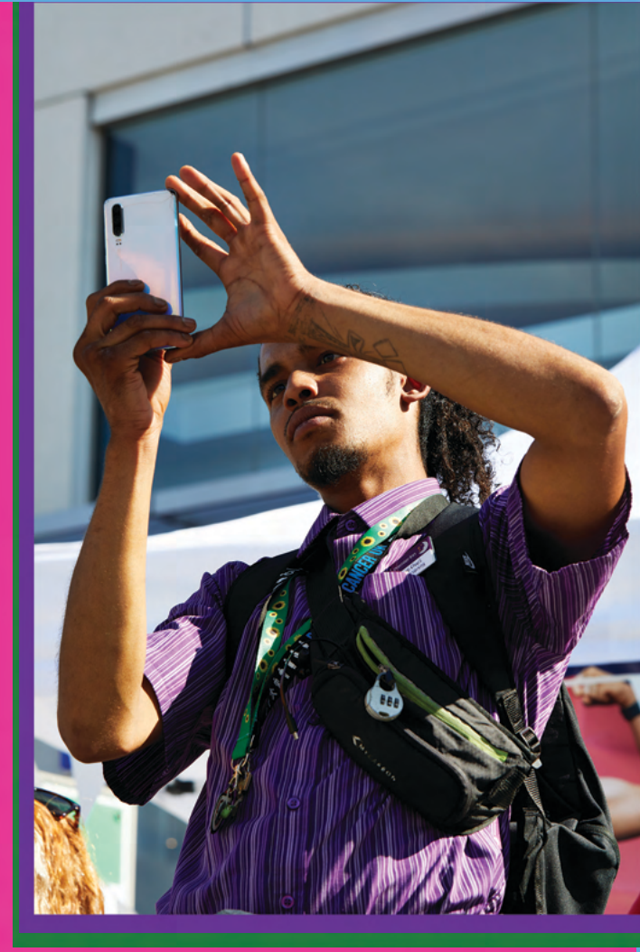
Audience member at the Stories of Strength day