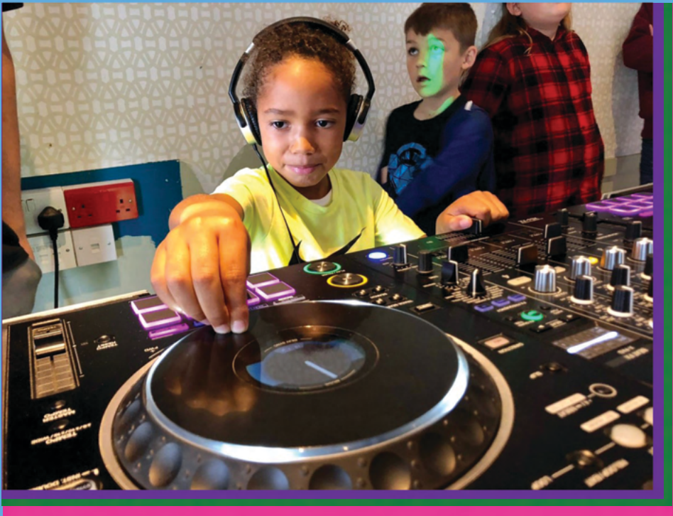
Give it a Go: DJing for beginners workshop

DJing, Bollywood Dancing, Papercutting, Manga, Poetry, Weaving, Create a Comic Strip