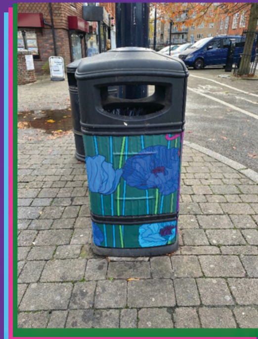
Street furniture, Crawley town centre