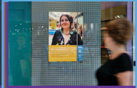
A Story of Strength from the exhibition