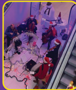
Ensemble Reza concert