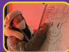
Give it a Go: Manga Art