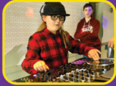
Give it a Go: DJing