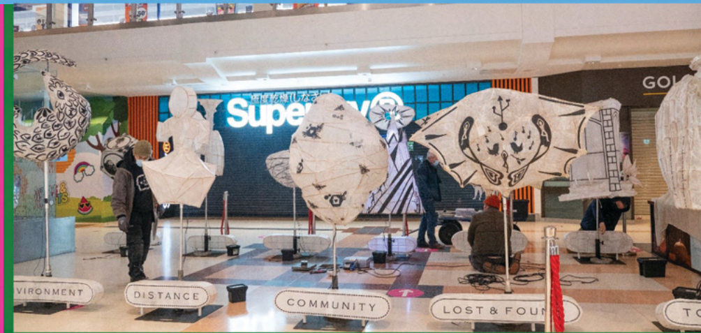
Same Sky's Awakenings exhibition in County Mall, Crawley, Right Here festival 2021