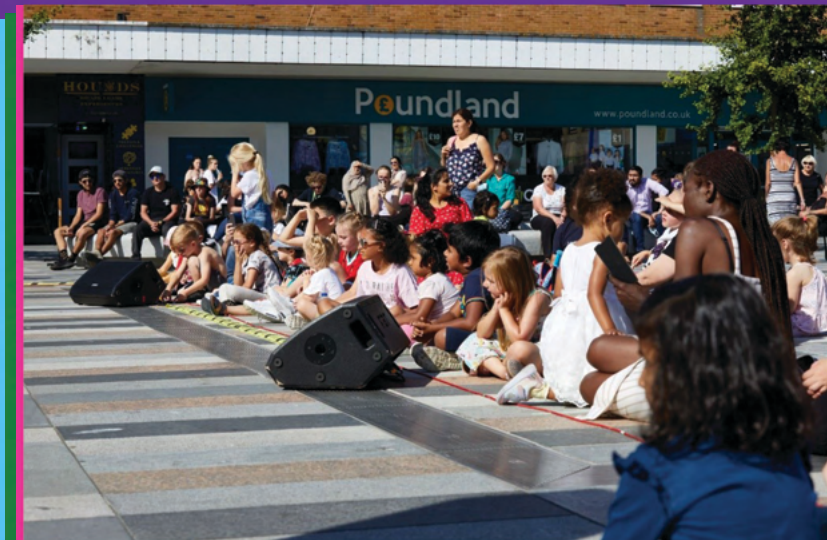
Audiences at the Stories of Strength day