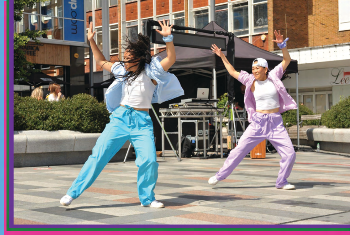
The Album: Skool Edition by SAY and The Place, Stories of Strength day