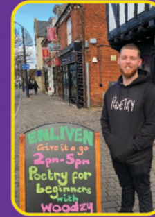
Give it a Go: Poetry