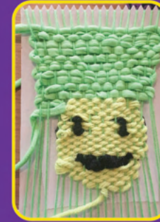
Give it a Go: Weaving