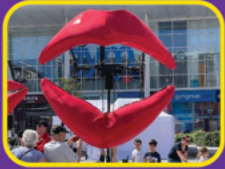
Stories of Strength Festival