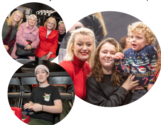
Advocates and Angels

Sarah's Driving School held a raffle and bucket collection, raising funds and making a cash donation to support the charity's mission. The donation money from this was put towards Easter packs for children that were in hospital during the Easter period and they were thoughtfully curated so that they were suitable for all children, whether nil by mouth, tubefed or on specialist diets.