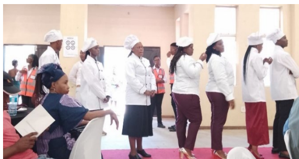
Catering students on graduation day