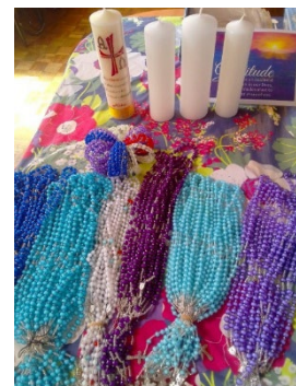
The course included making candles and rosaries