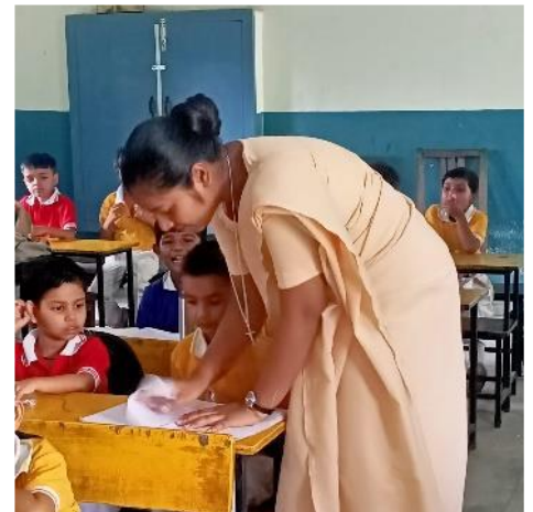
Education of children in the missions