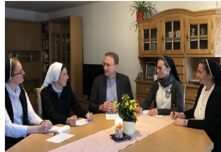
Spiritual renewal course