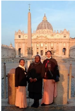
Three Holy Cross Sisters attending Formation Course in Rome

Ongoing formation helps the Sisters to deepen their spirituality and respond to the demands of the mission and challenges in the world.