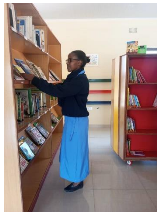
Sister in Initial formation is studying for her degree in the foundation phase, as an Educator as well as a three year course in Theology.