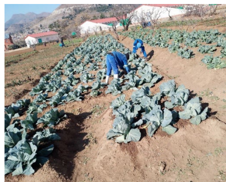
Learning about growing vegetables