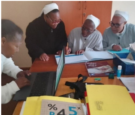
Learning computer skills