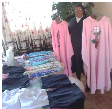
Liturgical vestments made by a sister during her training