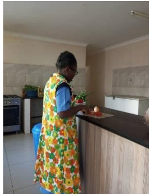
Sisters sharing community life - cooking and housekeeping.

For young sisters, community living becomes an important aspect in developing skills. Sisters learn to interpret their spirituality with community life and apostolic service.