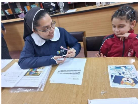
Sister teaching a young child in Chile to read