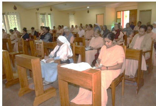
Sisters in Kenya on a formation course

One Sister wrote: "Retreat is a time to deepen our relationship with God, to reflect on our vocation and ministry, to renew our commitment, and to rekindle our spiritual flame. The Retreat also provides us with a time for rejuvenation in a supportive environment so that we can return to our ministries with renewed energy, clarity and dedication."