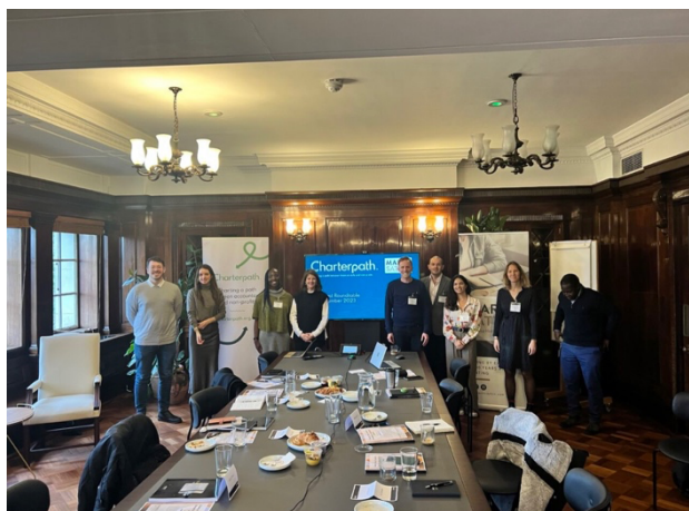
Charterpath round table event, Nov, 2023. Bringing together non-profits with finance professionals to explore how we can inspire more people into skills-based volunteering.