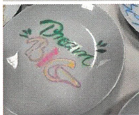
Cherished painting plates.

Living Keys now has 7 Volunteers who work tirelessly to make a difference in the lives of others.