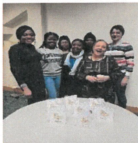
Some Cherished Ladies – handmade Easter Cards