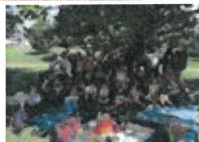
Living Keys family day out at Ferry Meadows.