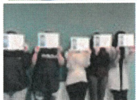
A few of our ladies from one of our courses.

Living Keys also attended "White Ribbon" day, remembering those who have been through abuse and those who have lost their lives to abuse, and to bring awareness that violence and abuse in a relationship is wrong. We met with other Agencies at the Town Hall and even met the Mayor who really showed an interest on the work that all Agencies did to support victims of abuse/violence.