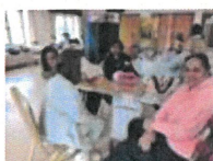
A few ladies from our SWAP Shop

We carried out a further SWAP SHOP, as it came back after popular demand. This is an event where our clients can bring in clothing that is too big, too small, childrens, ladies and men's clothing and they can leave with a new wardrobe totally free of charge.