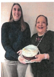
Cherished 9 th Birthday, celebrated with a Home baked and beautifully decorated cake.