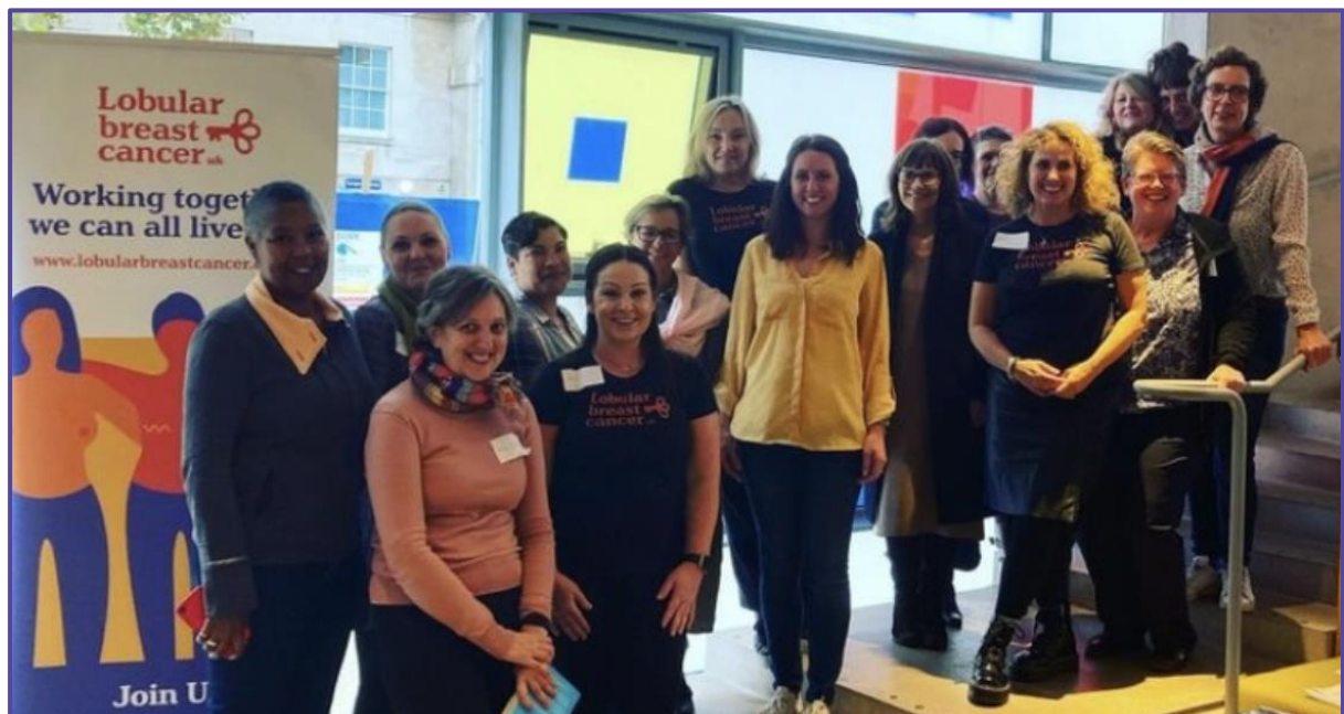
Our first Lobular Wellbeing Workshop at Maggie's Barts, November 2022