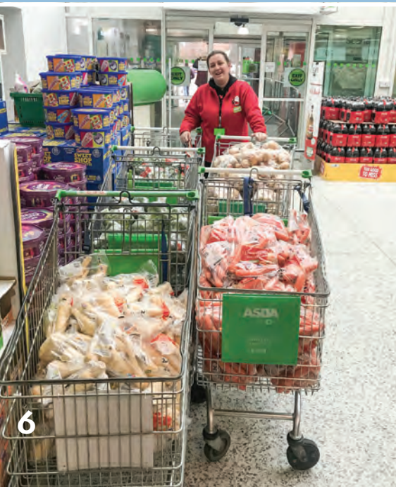
Left: Fresh vegetables from ASDA.

Along with volunteers from all walks of life and the generosity of local businesses and donations from the Blyth community our Christmas Eve hampers were all delivered by 7.30pm.