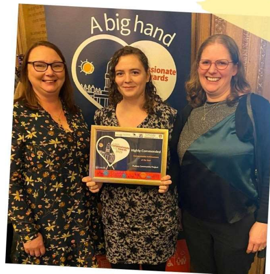
Highly Commended for ‘Environmental Achievement of the Year’ at the Leeds Compassionate City Awards

From the year before, where the majority of our work was solely through our foodbank, now we are providing both a continuing food support provision for the local area (feeding 400-500 people each week) but also a well-established web of programmes including the increasingly popular Reduce Reuse Kids’ Clothes and an expanded youth and children’s work provision. Numbers at our seniors’ lunch club, pantry, youth work and children’s clothes have all grown - but our food parcel numbers have dropped slightly from last year - good news as it shows the success of Pudsey Community Pantry in providing a more sustainable means of providing food support with more dignity, control and choice than emergency food aid can give.