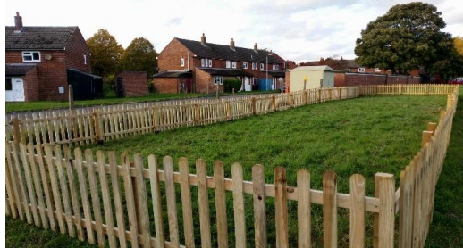
Garden at RAF Waddington