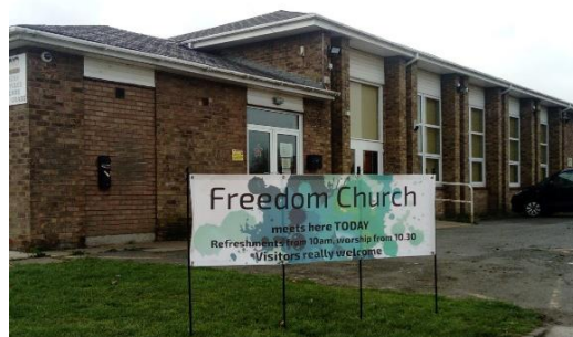
Gathering at Waddington Village Hall

Gifts to other ministries – Freedom Church Waddington makes a monthly donation of £100 to Regions Beyond UK. Additionally, the church gave a gift of £1,000 to St Michael's church, Waddington to assist in the costs of heating their church building for the weekly Warm Welcome sessions.