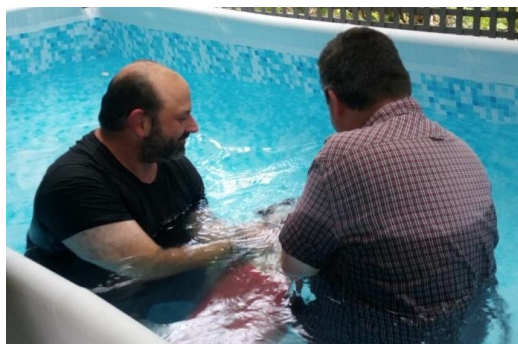
Baptising people into God's family