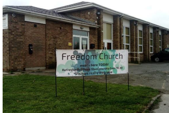
Gathering at Waddington Village Hall

Gathering together – Freedom Church Waddington met in Waddington Village Hall each Sunday morning to worship together. This took the form of singing, praying, reading the Bible, teaching one another and eating together. Teaching was given in an age-appropriate way, with adults listening to a prepared sermon and children enjoying their own activities. However, at the start of 2021 the church continued to meet on Zoom, regularly gathering 25 people together each Sunday. In July the church resumed face-to-face gatherings at Waddington Village Hall. The church also gather for a mid-week Life Group and this also continued on Zoom. Expenditure under this heading consists of hiring Waddington Village Hall, a subscription to Zoom, and resources to offer refreshments.