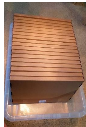
Craft boxes ready for delivery

Mission – Freedom Church Waddington continued to offer free craft boxes to families so that they could keep enjoying some of the activities they had become accustomed to at our previous 'Soggy Saturday' events. The craft boxes were also advertised through local Facebook groups to maximise the number of families supported. We distributed 280 sets of craft activities to 239 children in 137 families. Additionally, the church organised a 'Light trail' at the end of October and at Christmas. Expenditure under this heading consists of resources that were given away in craft boxes, and resources and refreshments for the 'Light trails'.