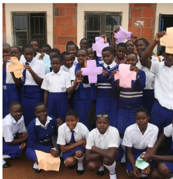
Mukomo School for Special Needs & Sir Apollo Kagwa Secondary School

In 2024 we were able to reach more disadvantaged young women and girls through our 5-part MHM curriculum, totalling over 1,200 people. Our curriculum opens up conversations about MHM to break the stigma and teach essential MHM knowledge and skills.