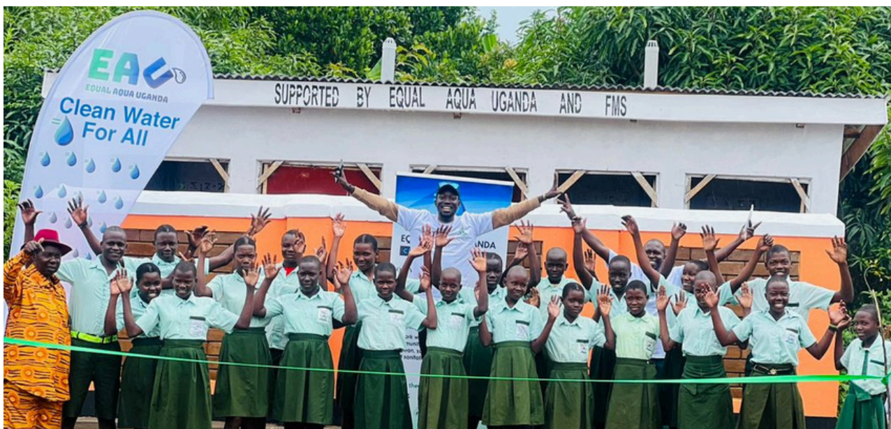
Sustainable Pit Latrine at Ebenezer Primary School, Eastern Uganda