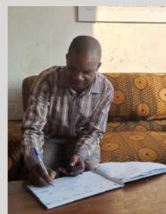
Headmaster St. David School

I really want to call upon the community to embrace such a technology because communities are able to build affordable housing. In fact my next class room block has to be constructed using ISSBs.”