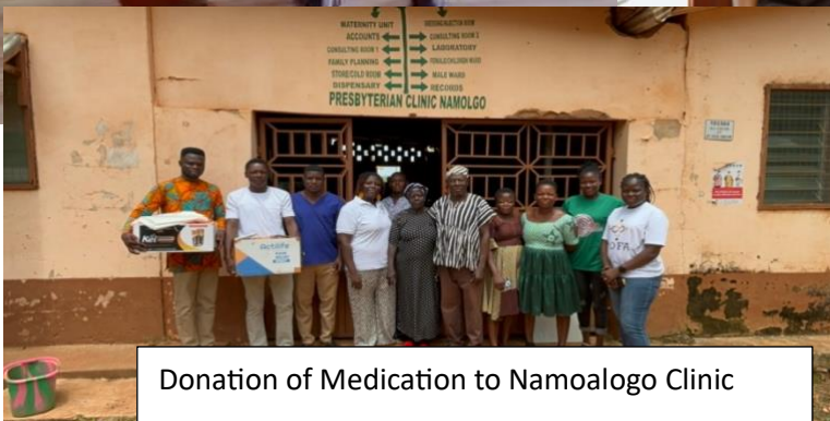
Donation of Medication to Namoalogo Clinic