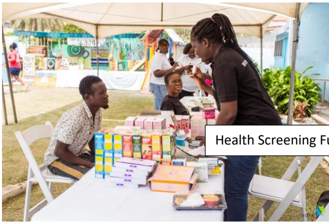
Health Screening Fundraiser