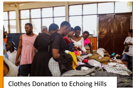
Clothes Donation to Echoing Hills