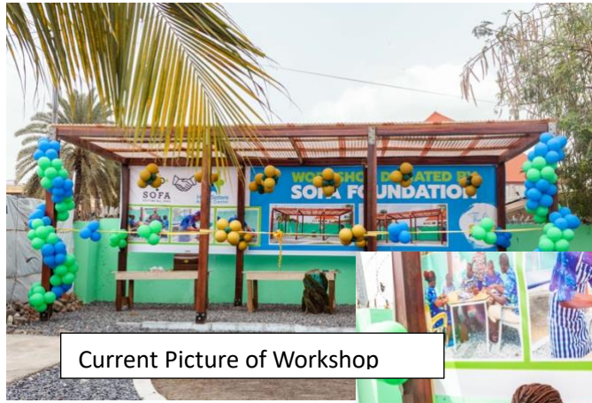
Current Picture of Workshop