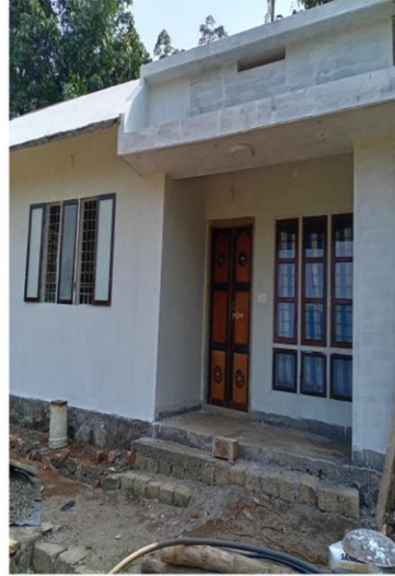
Completed House Project 2