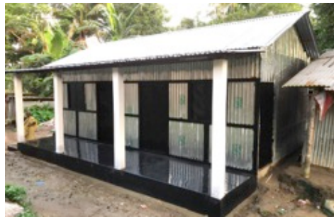
Newly finished house in Shantir Neer

A design of a basic, sturdy, and affordable home has been drawn up by a local designer on behalf of the Trust. Once the provision of land has been established the final cost of each property comes to approximately £1,850. Although by Western standards these homes are primitive, they are a huge improvement on what has been available to the poorest local residents to date. The beneficiaries, selected by a transparent selection process based on need, are therefore offered a life changing opportunity to enjoy a transformation in their living standards and prospects. In future, it is sought to provide funding for more such homes, using the very same local selection processes with final decisions being made by Trustees in England to provide full clarity and accountability.