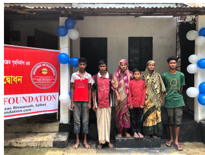
House handover in Banashpur Village

There has been and continues to be an established local publicity campaign to raise awareness. The connection to village committees, constituted from volunteers that have significant roles in the community, has been essential in widening local awareness. Each property that has been erected bears a Trust plaque that also describes the source of the benefit (for example, single UK beneficiaries). A visual account of this is recorded on the Trust's website.