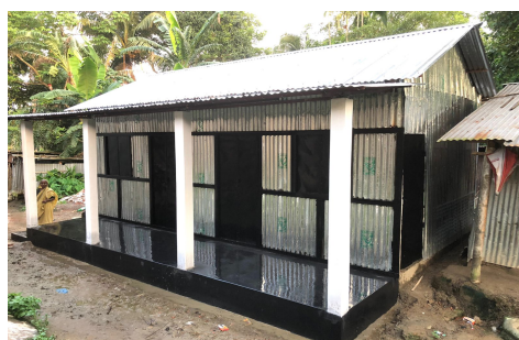
Newly finished house in Shantir Neer

A design of a basic, sturdy, and affordable home has been drawn up by a local designer on behalf of the Trust. Once the provision of land has been established the final cost of each property comes to approximately £1,850. Although by Western standards these homes are primitive, they are a huge improvement on what has been available to the poorest local residents to date. The beneficiaries, selected by a transparent selection process based on need, are therefore offered a life changing opportunity to enjoy a transformation in their living standards and prospects. In future, it is sought to provide funding for more such homes, using the very same local selection processes with final decisions being made by Trustees in England to provide full clarity and accountability.