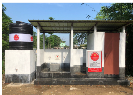
Public toilet under construction at Lala Bazaar