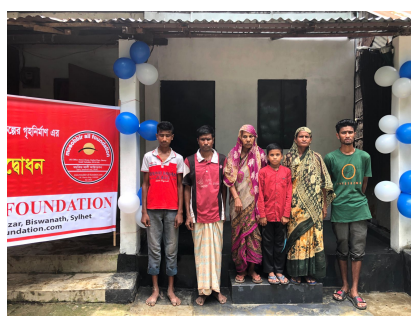
House handover in Banashpur Village

There has been and continues to be an established local publicity campaign to raise awareness. The connection to village committees, constituted from volunteers that have significant roles in the community, has been essential in widening local awareness. Each property that has been erected bares a Trust plaque that also describes the source of the benefit (for example, single UK beneficiaries). A visual account of this is recorded on the Trust's website.