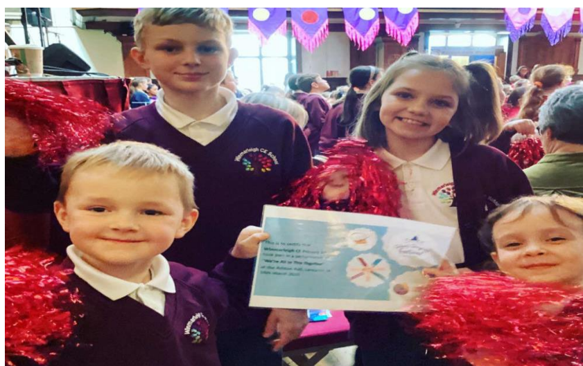
Ellel St John's Church of England Primary School