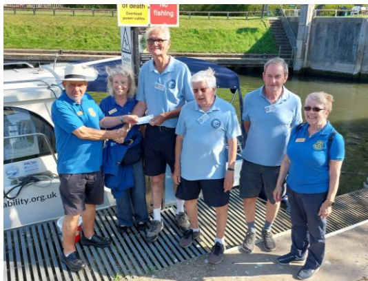
Sunbury & Shepperton Rotary Club presenting us with the final instalment of the President's Fund at the Shelterbox event.