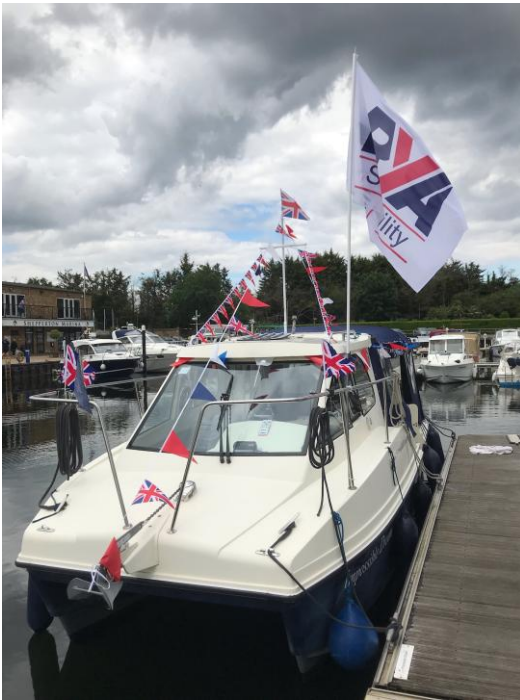
Impossible Dream ready to for river celebration events