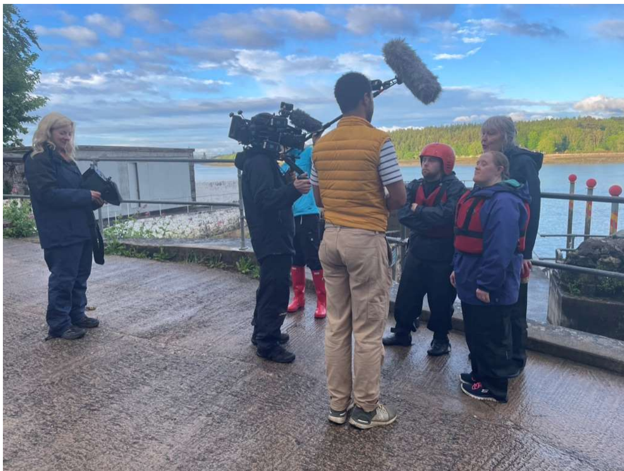
SEAS participants being interviewed on ITV Wales 'Coast and Country'