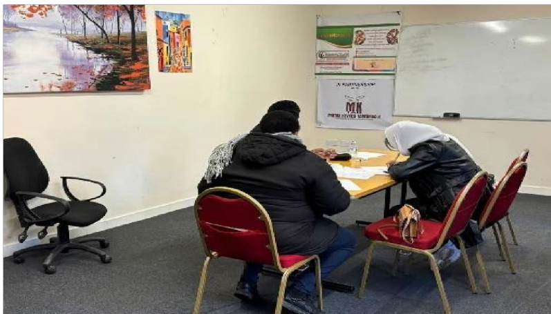
In- person / Face 2 face mentoring.