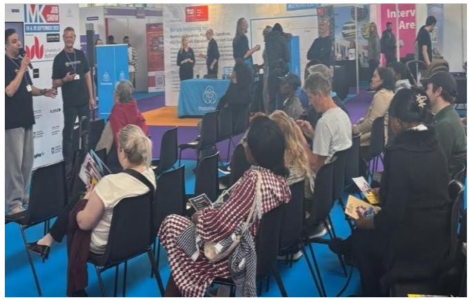
E4s team at a Job fair; Building connections and fostering collaborations. -----