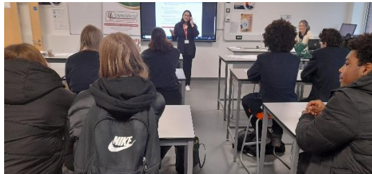
E4S training activities at Schools & Youth Institutions.