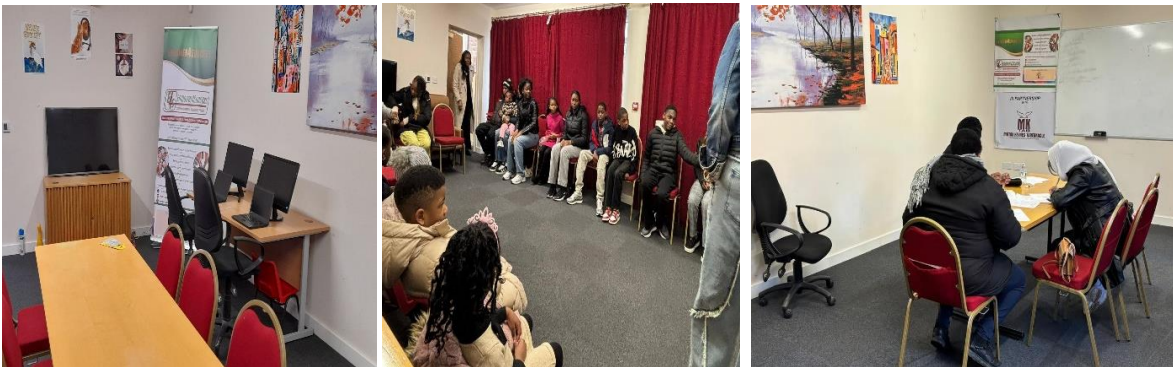
E4S in-house activity space: 'Play & Learn' activities + Face 2 face mentoring.