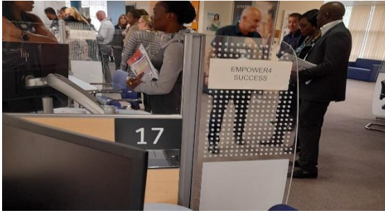
Empower4success (E4S) team recruiting customers at a local Job Centre.