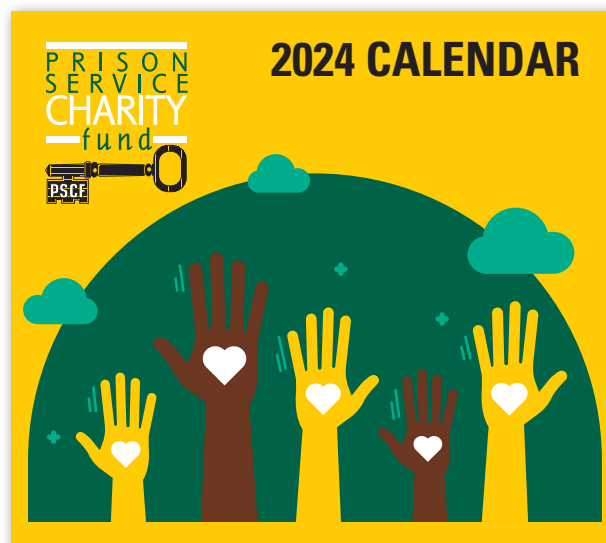
Photo shows the front cover of our calendar.

Another task finalised was the production of a revamped 2024 Calendar. Past years we just had landscape pictures for each month, but your Committee suggested it would be a good idea to use photos of Charities we have supported over the year and as a result we have received some very good comments liking it. Thank you again.