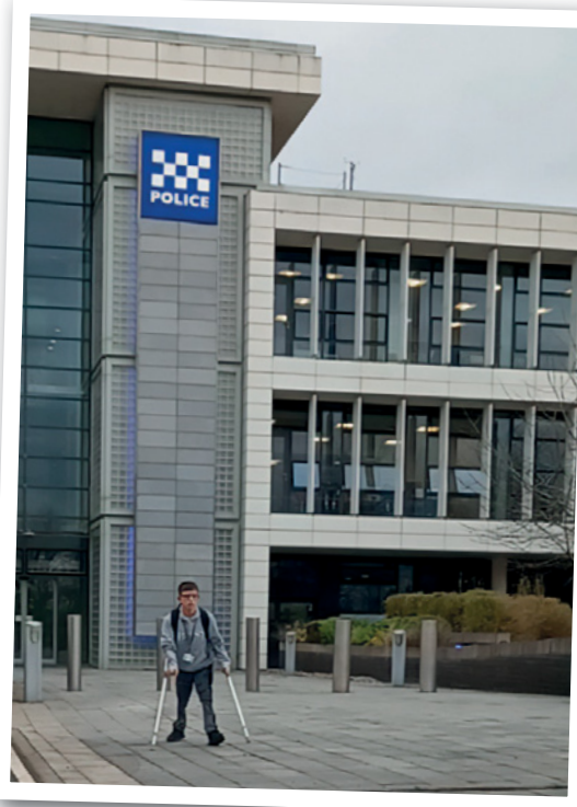
Another day completed at HQ