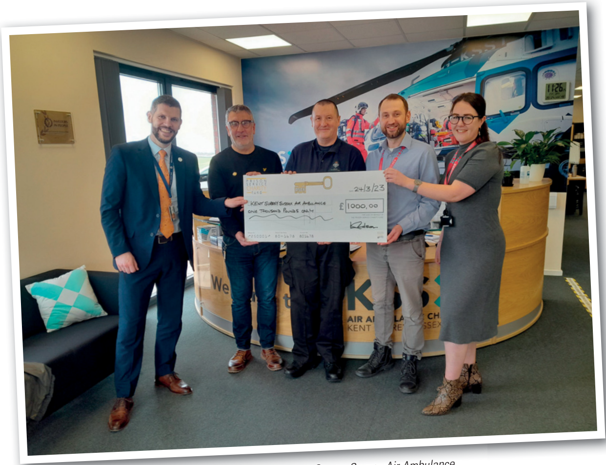
Our Rep from Cookham Wood presenting cheque to the Kent, Surrey, Sussex Air Ambulance