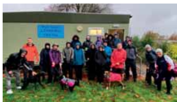
Staff from HMP Humber, enjoy a Sunday afternoon walk in the rain, to raise funds for the Queens Centre