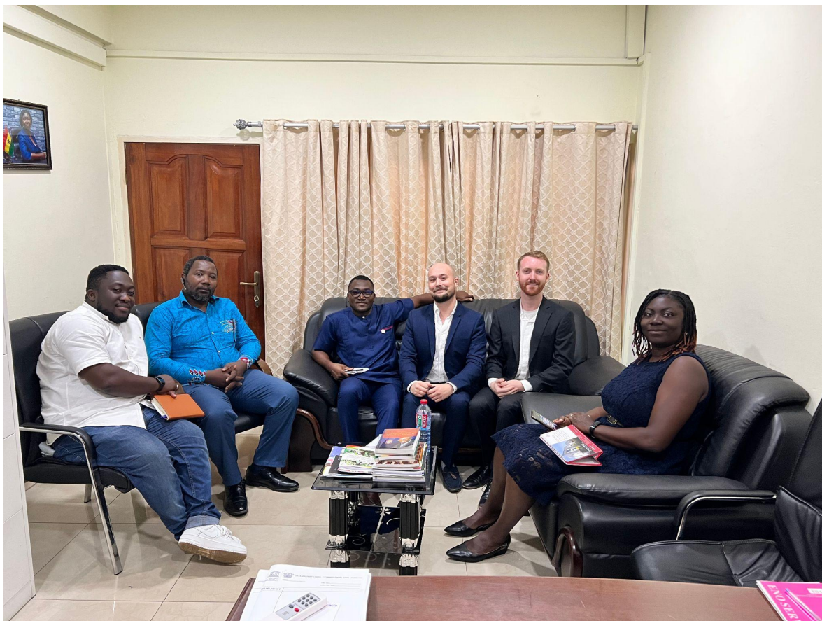
(Image) The first meeting in Accra, Ghana to establish the partnership between Project Partners and the Ghana Commission for UNESCO (GCU). 13th May 2022