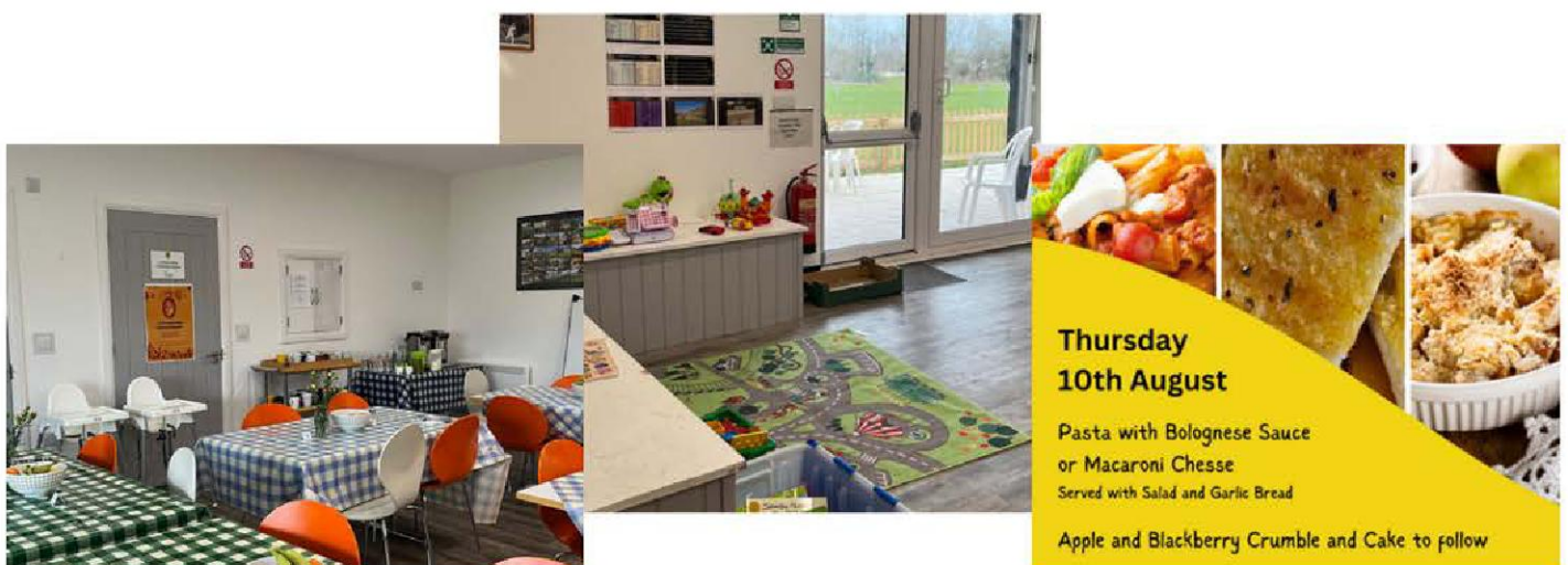
The Cricket Club ready for a Northcroft Kitchen session and one of our FB posts advertising what's going to be on the menu

We would like to say a big thank you to all our volunteers and for the support from Homestart, the Family Hub and school Family Support Workers.