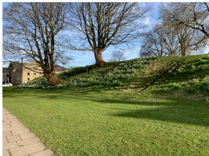
Riverside Gardens in the Snow Bulbs planted at the New Brook Street Promenade