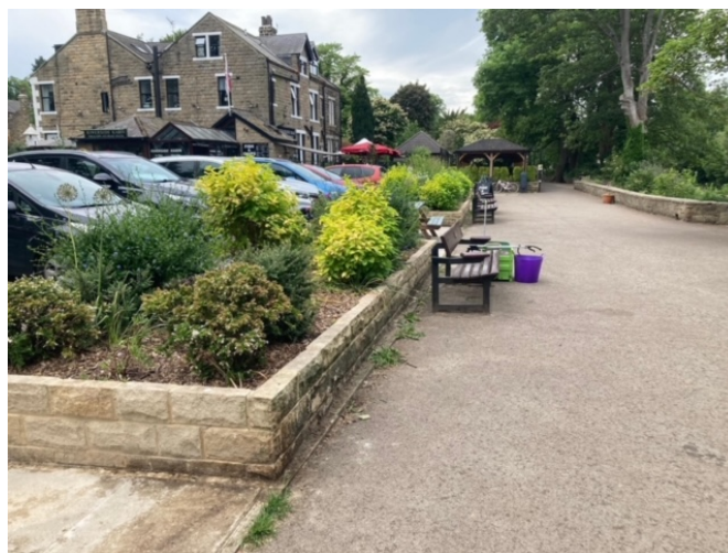
New Stone Raised Beds Riverside Gardens Autumn 2022

The Committee of the charity will recruit additional trustees as required, having the appropriate skills to join the Committee and assist in the running of the organisation, subject to the approval of members at the first Annual General meeting after their nomination.