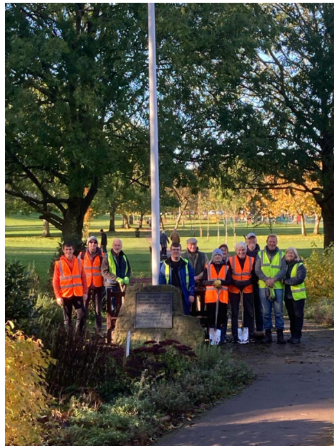
Volunteers at the Memorial Flowerbeds for Remembrance Day 2023

The trustees present their Report and Accounts for the financial year 1 April 2023 to 31 March 2024. FOIRP became a Registered Charity. No. 1189048 in April 2020