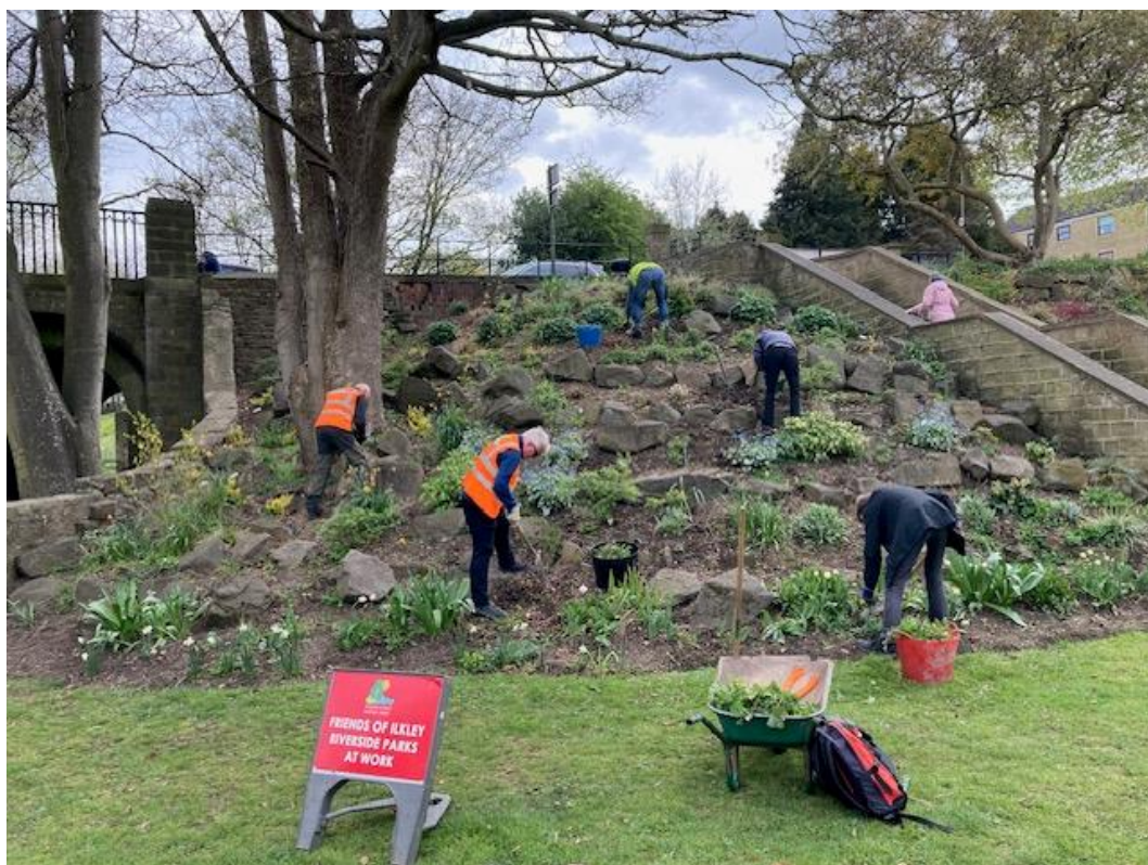
FOIRP volunteers working on Entrance Embankment of Riverside Gardens

In setting our objectives and planning our activities our Trustees have given serious consideration to the Charity Commission's general guidance on public benefit and in particular, ensuring that the public living within the scope of our charitable purpose gain real and measurable benefit from the activities we carry out.