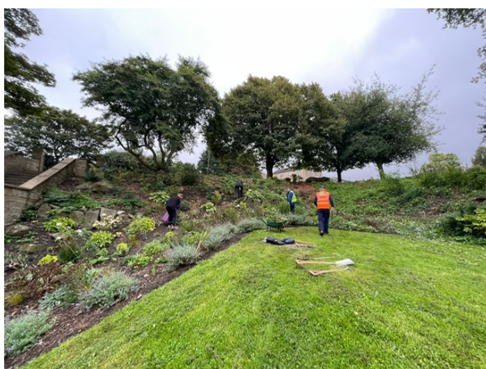
Looking after planting on the Embankment is a regular job!

In setting our objectives and planning our activities our Trustees have given serious consideration to the Charity Commission's general guidance on public benefit and in particular, ensuring that the public living within the scope of our charitable purpose gain real and measurable benefit from the activities we carry out.