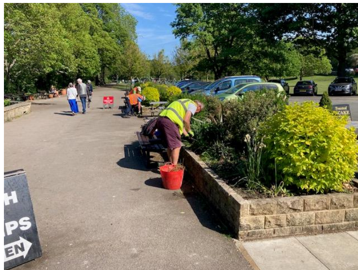
Working on Raised Beds