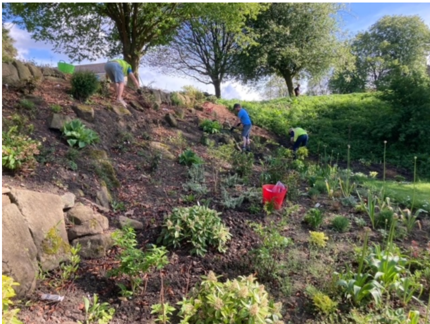
New Planting Embankment Riverside Gardens 2022

In setting our objectives and planning our activities our Trustees have given serious consideration to the Charity Commission's general guidance on public benefit and in particular, ensuring that the public living within the scope of our charitable purpose gain real and measureable benefit from the activities we carry out.