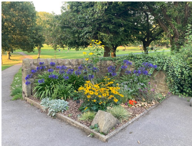
Autumn Display at Bridge Lane Entrance

The Committee of the charity will recruit additional trustees as required, having the appropriate skills to join the Committee and assist in the running of the organisation, subject to the approval of members at the first Annual General meeting after their nomination.