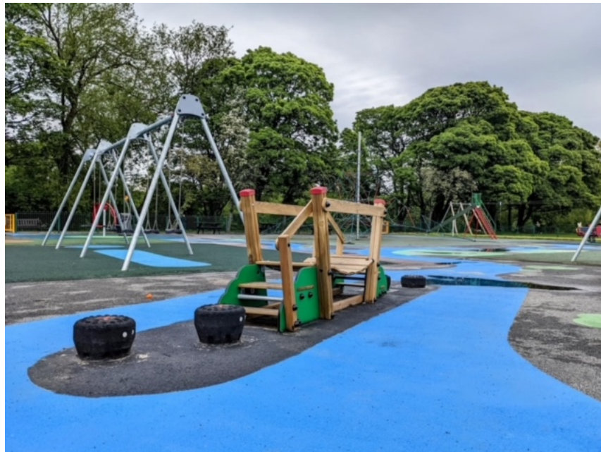
Revitalised Playground with new equipment Summer 2022