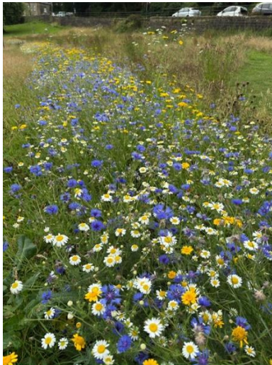
The Wildflower Area

Part of the regular tasks of the FOIRP team is to keep a general eye on parks and to report any major disturbances or Anti-Social Behaviour to the Council and the Police, with whom we keep a regular liaison.