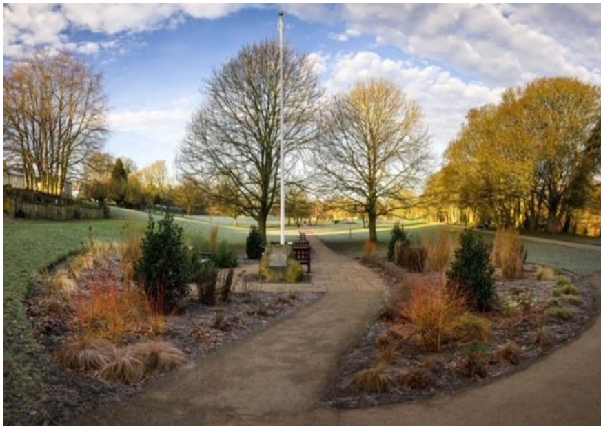
Memorial Flowerbeds created by FOIRP in partnership with Helen Taylor Associates

The trustees present their Report and Accounts for the financial year 1 April 2024 to 31 March 2025. FOIRP became a Registered Charity. No. 1189048 in April 2020