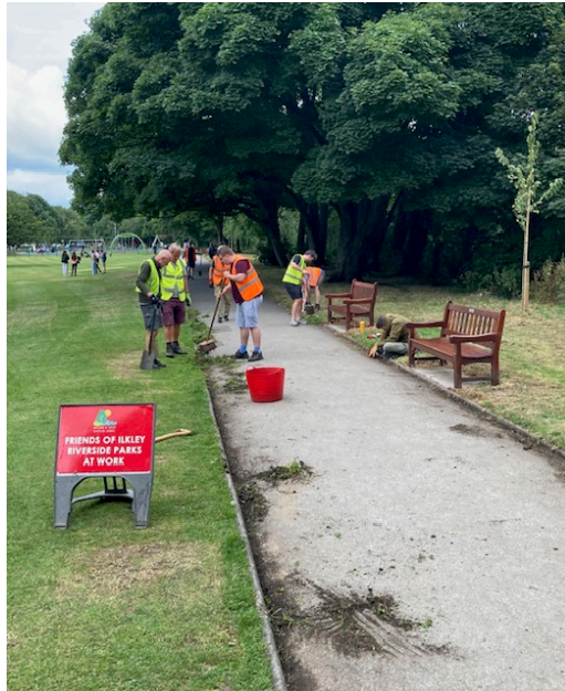
Regular Work Parties every week keep the Parks Spic & Span!