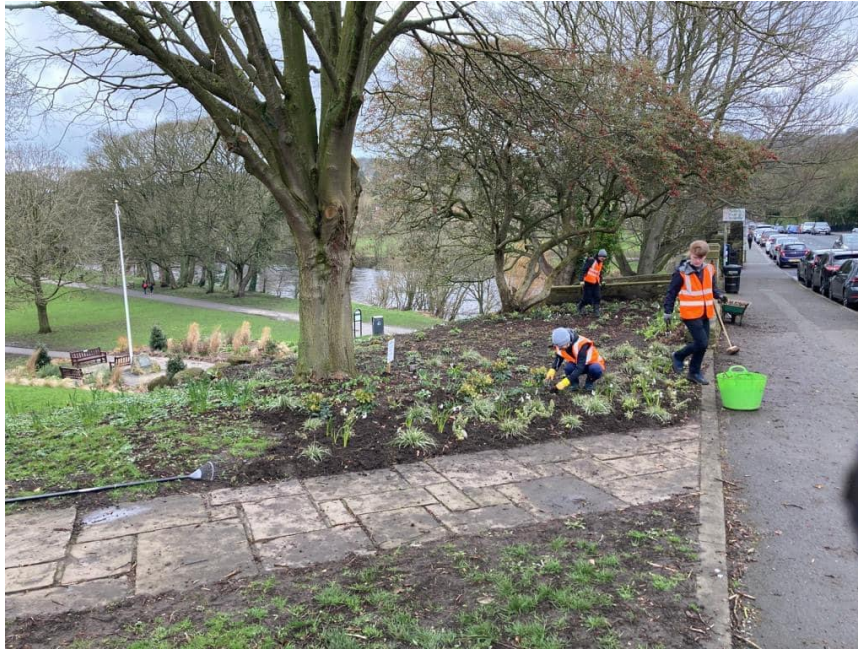
New Planting at Embankment Riverside Gardens – Autumn 2022

In 2022/23 , apart from the regular work including Litter Picking, looking after the newly created flowerbeds in the parks and the general maintenance tasks carried out by the Group, the following improvements have been achieved;