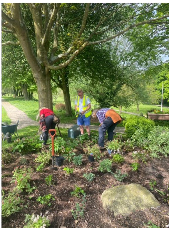
New Planting at Triangular Flowerbed off New Brook Street

In 2023/24 in addition to the regular work which has taken place including Litter Picking, looking after the newly created flowerbeds in the parks and the general maintenance tasks carried out by the Group, the following improvements have been achieved;