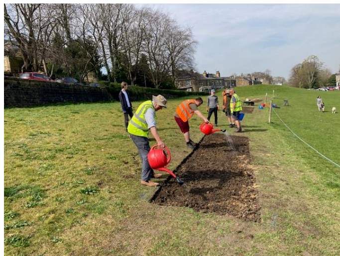
Preparing wildflower beds and sowing seeds

The following further improvement works were carried out during 2024/25;