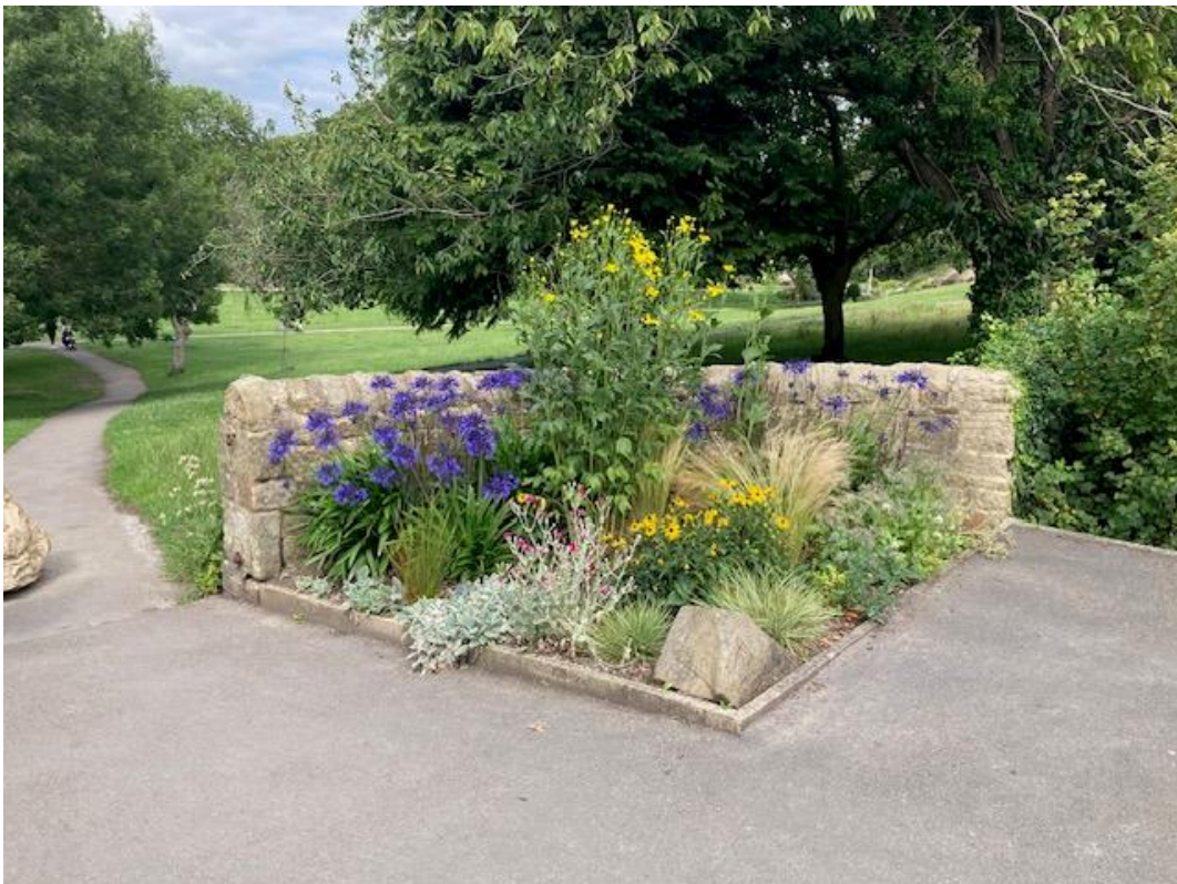
Bridge Lane Entrance Flowerbed in bloom 😊

Funding for all the above has either been raised directly by the charity or in the case of a few projects at our urging or as a result of pressure from the charity to ensure the projects take place. Our community and local businesses and organisations have supported many of our projects generously and for that we thank them greatly.