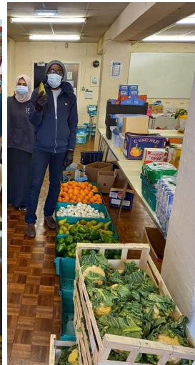
Weekly food distribution