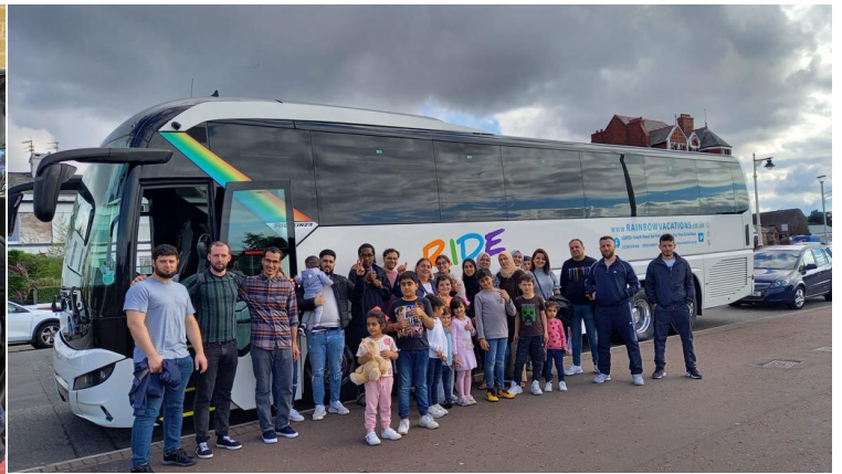
Family day trip to Southport