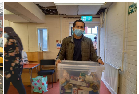
Boxes of food donations from Blackburn Rovers for clients