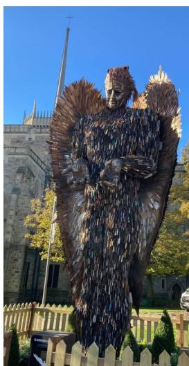
EC students trip to see the Knife Angel