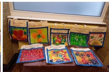
ILHAM project art work