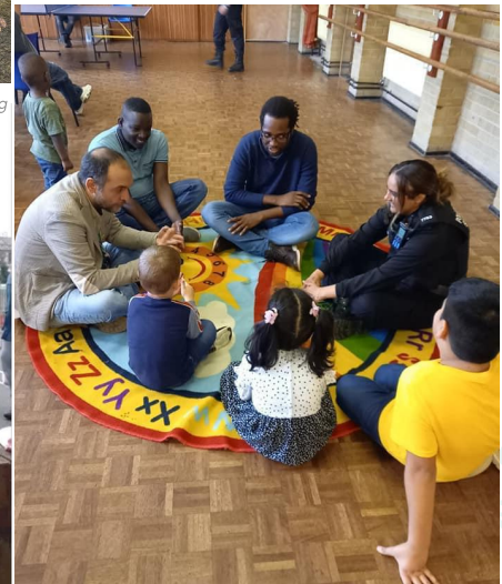
A standard Tuesday drop in