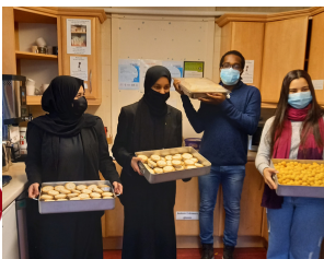
Donated baked goodies from TIGHS