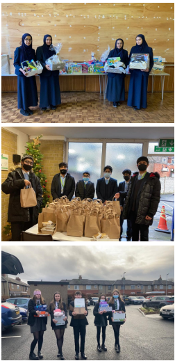
Various high schools dropping off winter gifts

As the Covid restrictions slowly eased, ARC was finally able to open our doors again. We were back in full swing this year with our regular activities such as the Drop-ins and a host of new projects too!