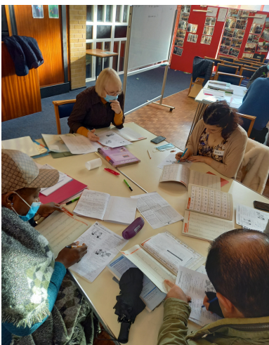
On-site English Club back in full swing