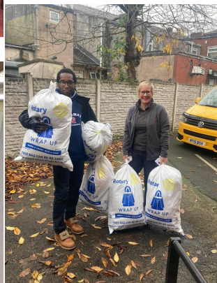
Wrap Up Lancashire donating winter clothing