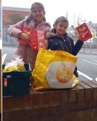
Easter egg gifts for our young clients