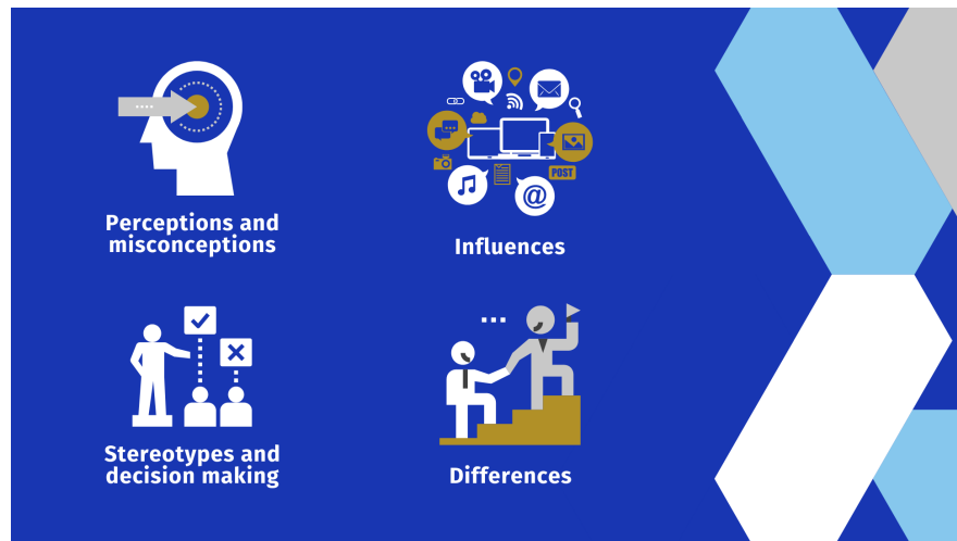
Slide from Identity and Inclusion training

We improved our course presentation to make it more engaging and easier for trainers to deliver. We delivered a 3-hour condensed version of the 9-hour material to a local charity who we have a continued relationship of offering bespoke training to.