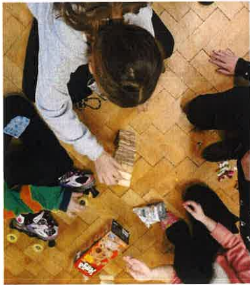
Floor games: Teenagers playing Jenga