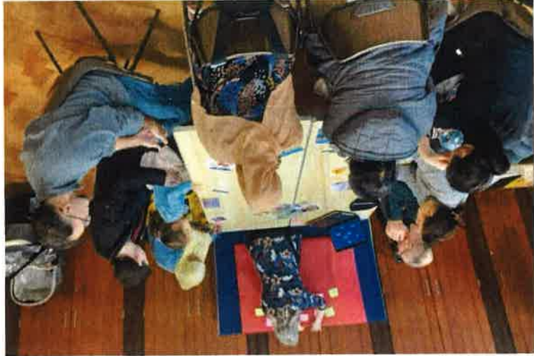
Refugees @ winter welcome creating a poem on 'Memories'

Our Lambeth funded winter welcome warm spaces debuted Jan - March23 with more than 120 families and children attending. Together Streatham Hill Neighbourhood Watch Meet ups sees large numbers of residents meeting their local police personnel and discussing anti-social violent behaviour. A worshipping community meet to pray for the community every Tuesday morning.