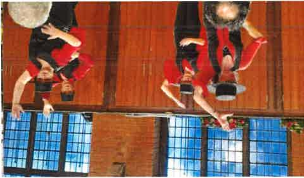
Flamenco dance at Christmas 23 event

Family parties continue with repeat customers, introducing their friends and neighbours – the completed courtyard space has made parties more vibrant as it lends to spilling out in good weather. The awe inspiring and jaw-dropping expressions when the new ceiling/roof in the hall is viewed for the first time continues in amazement.