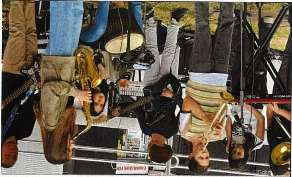
Younger YouthSayers performing at InStreatham BID Food Festival23

We continue to strengthen our community outreach and collaborative engagement to attract many new local groups and organisations requiring space to expand their reach into Streatham. The Young YouthSayers skills and talent was showcased with amazing performances at InStreatham BID food festival July23 and Streatham Space Project workshop in the heart of community. YouthSayers closed Streatham Strut at Rabbit Hole, October23.