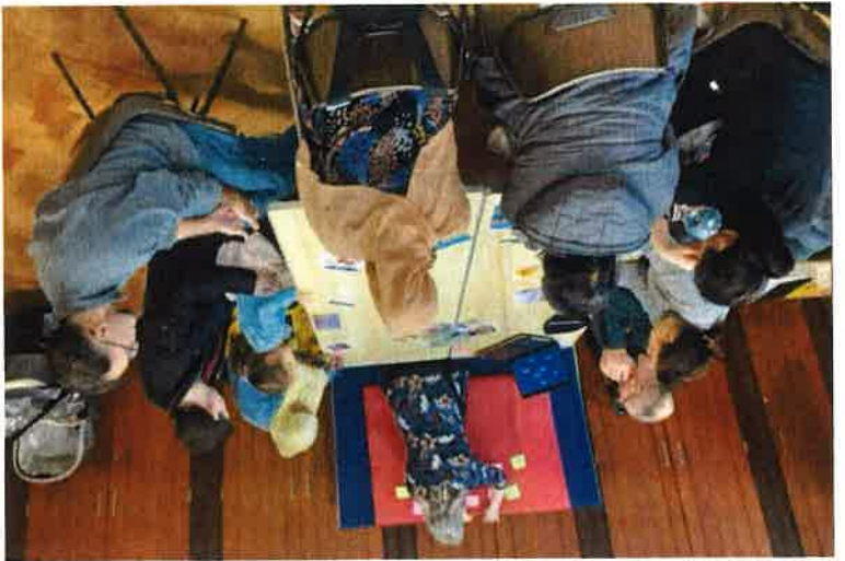
Refugees @ winter welcome creating a poem on 'Memories'

Our Lambeth funded winter welcome warm spaces debuted Jan - March23 with more than 120 families and children attending. Together Streatham Hill Neighbourhood Watch Meet ups sees large numbers of residents meeting their local police personnel and discussing anti-social violent behaviour. A worshipping community meet to pray for the community every Tuesday morning.