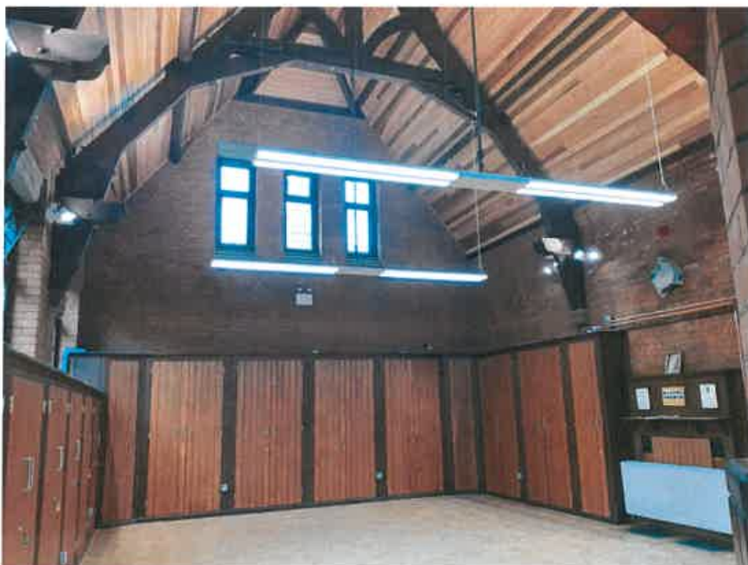
Main Hall transformation

We raised a total of £944,000, a little shy of the £1million budgeted for in our fundraising strategy plan. A big thank you to all our generous donors; The Big Lottery: Reaching Communities grant, The Lockwood Charitable Foundation, Garfield Weston Foundation, All Churches Trust, Bernard Sunley Foundation, The Tudor Trust, The Laing family Trust, National Churches Trust and Southwark Diocese.