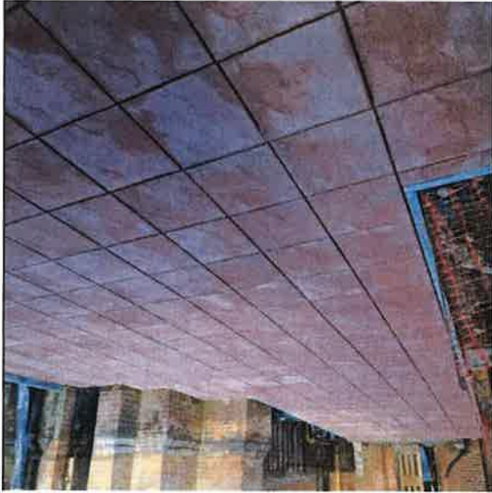
After - courtyard paving

A big thank you to Asda Foundation's Investing in Spaces and Places for their £20k communities grant as "... this is a development that seeks to be inclusive of working white class and disproportionate communities and accommodate disabled access and volunteers...".