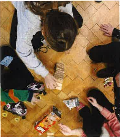
Floor games: Teenagers playing Jenga

St Margaret the Queen, Streatham Hill, London SW2 3BH