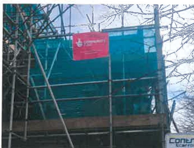
Scaffolding up and work begins with excitement