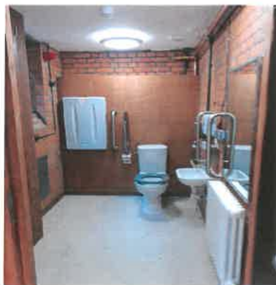
New accessible WC