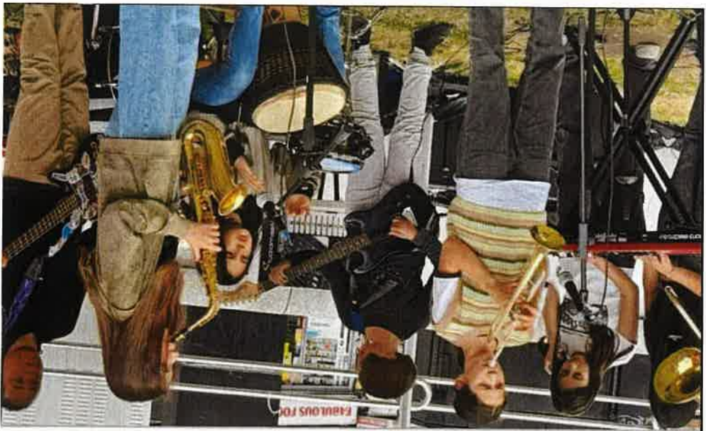
Younger YoutSayers performing at Instream BID Food Festival23

St Margaret the Queen, Streatham Hill, London SW2 3BH