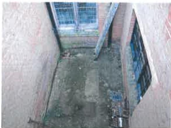
Before: Light well before refurbishment.