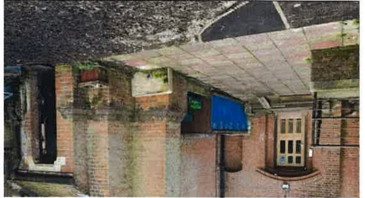
Courtyard Before Asda grant

We embarked to the external works following a substantial Asda foundation ISP grant which includes the formation of new gradient and repaving of the northwest courtyard, installation of timber fencing and work to the basement ventilation well and opening up the basement for more community use. photos before and after below. This work was executed with skill and conscientious precision by Groundworks and Landscaping Services Ltd, using the RIBA concise building contract 2018.