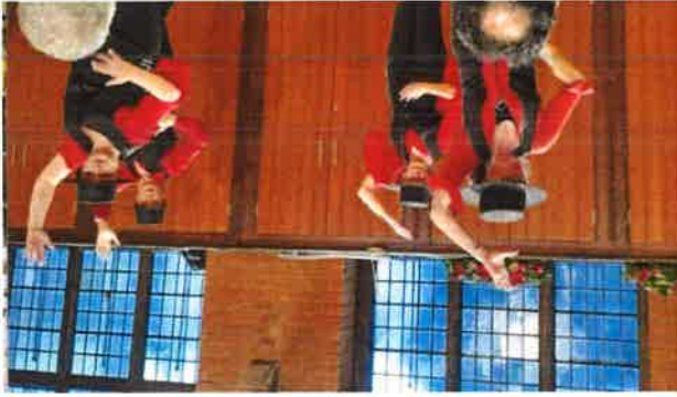
Flamenco dance at Christmas 23 event

Family parties continue with repeat customers, introducing their friends and neighbours – the completed courtyard space has made parties more vibrant as it lends to spilling out in good weather. The awe inspiring and jaw-dropping expressions when the new ceiling/roof in the hall is viewed for the first time continues in amazement.