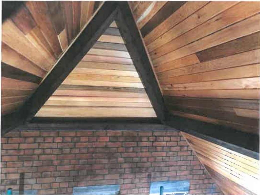
New Roof structure and roof coverings