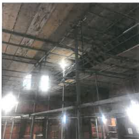
Main hall under construction