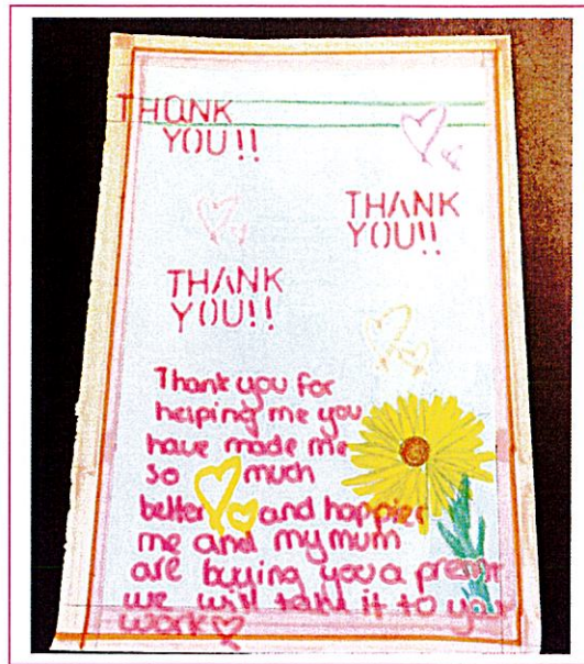
Thank you letter from a grateful child