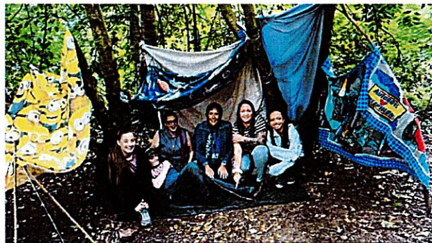
Den building in the school holidays!