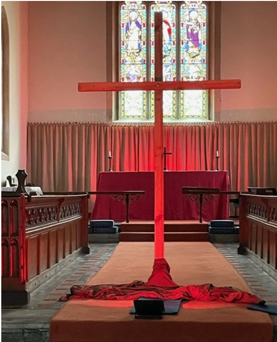
Easter—always a special time in the Christian calendar