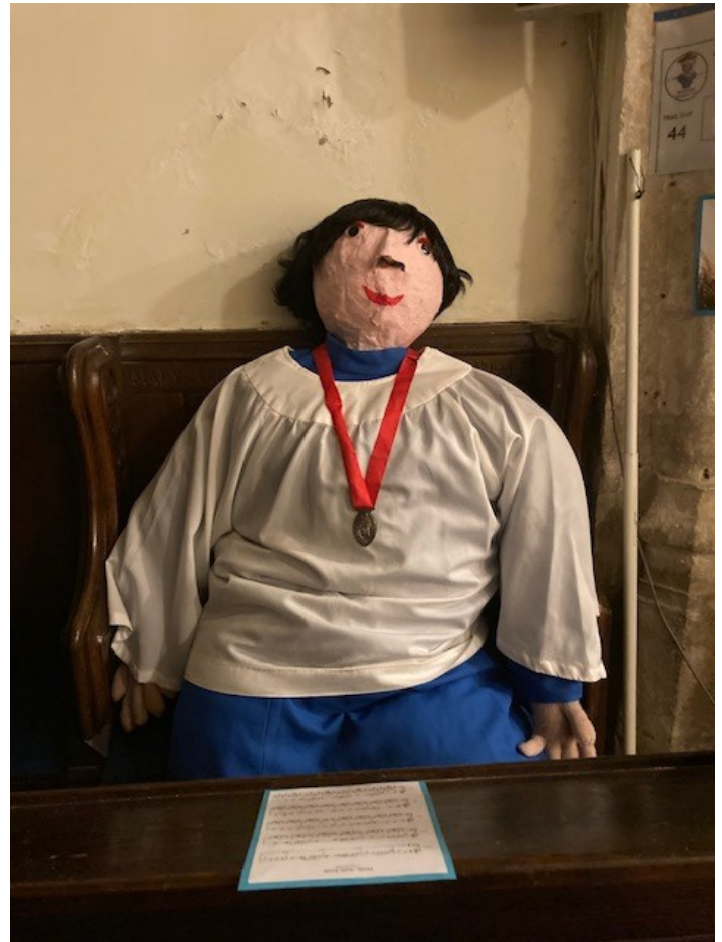
Brent Knoll Scarecrow Competition

In September we started a new 'Fun in Fundraising' Group,