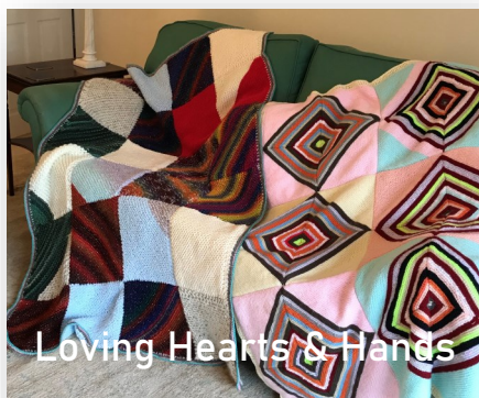
Loving Hearts & Hands