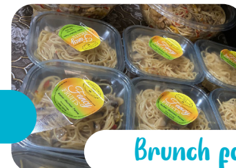
Brunch for families