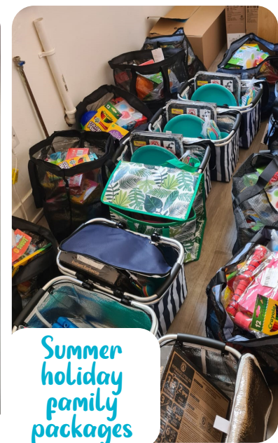
Summer holiday family packages