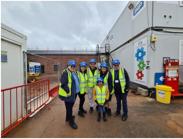
Deaf Mental Health Forum visits the new Hospital at Kingsway and shared feedback from the Deaf perspective. CU is the chair for the forum