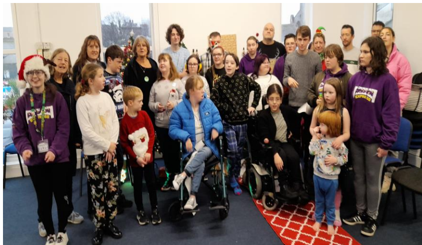
A selection of 2023 Drama Express Photos