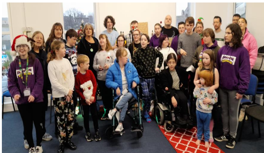
A selection of 2023 Drama Express Photos