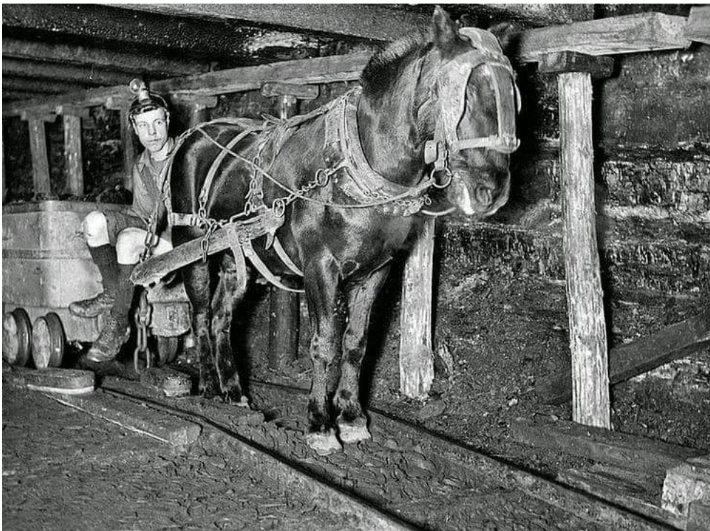
Pit Pony - Miner's great friend

As engaging young people is a priority for us, efforts will be made next year to find new ways to reinvigorate this activity and attract new volunteers.