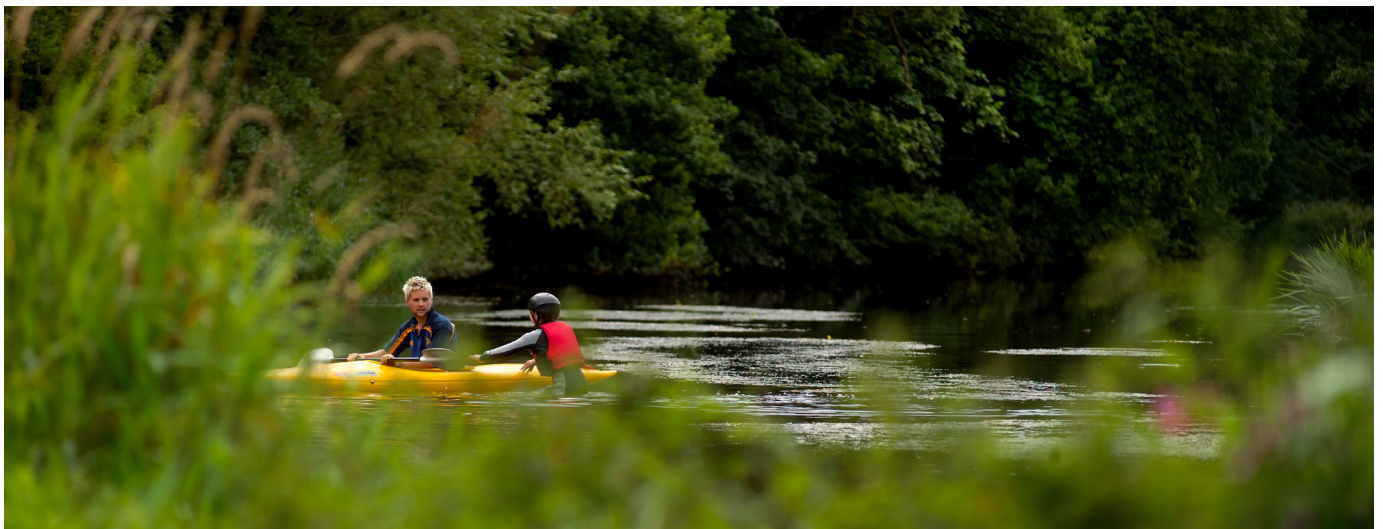
River Derwent - Ebchester

These included environmental improvements - such as planting woodland and building a fish-pass - and working with young people in schools on local culture, with 320 participants gaining a recognised qualification in traditional skills. A major success was building a new Heritage Centre at Winlaton Mill, owned and managed by Groundwork North East and Cumbria. The Heritage Centre has a successful café, acts as a community hub, and runs a year-round events programme.