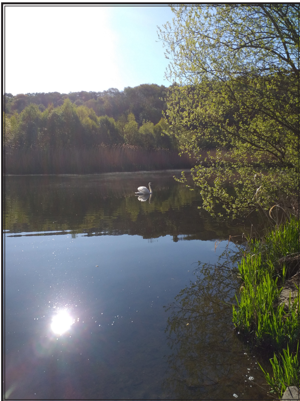
Clockburn Lake, Winlaton Mill