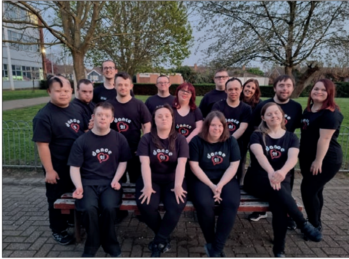
Dance 21 Seniors