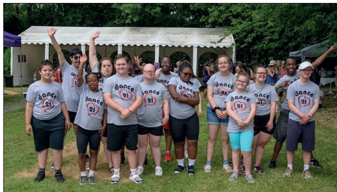
Dance 21 Woodford