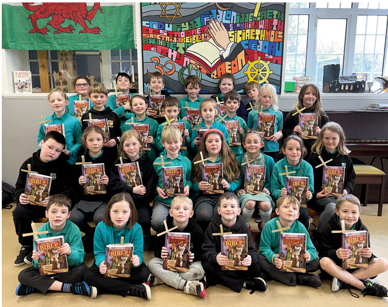
Delighted children with their Bibles in a Welsh Primary School.