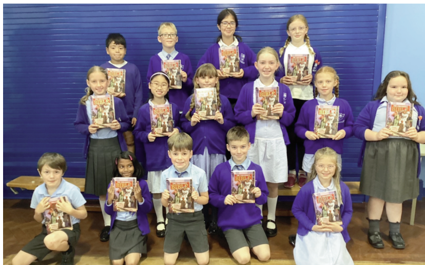
Delighted children holding their Children's Bibles.

2,309 pupils and their teachers received a personal Bible in the 16 schools using the 'Re-Start Scheme' this year.