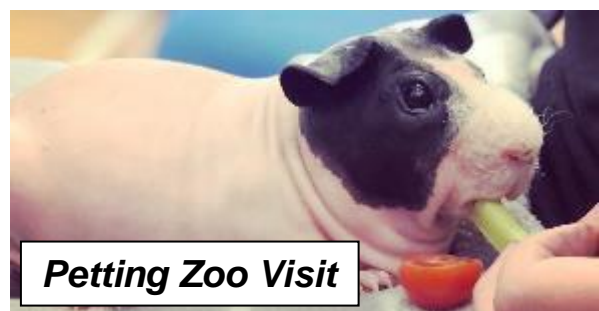
Petting Zoo Visit

Our aim is to continue to run sessions for all ages at Shilbottle Community Hall, developing the groups we have already established, and creating new groups as the demand arises and funding allows.