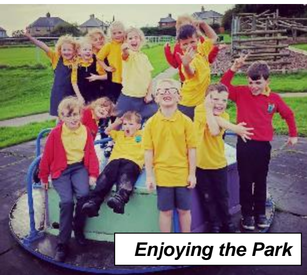
Enjoying the Park

Our part-time Lead Youth Worker, who plans and runs the sessions, has been ably supported by volunteers. She has led the work well and has established a good rapport with the children, young people, young mums and families who are accessing the project. We continue to seek a part-time Support Youth Worker.