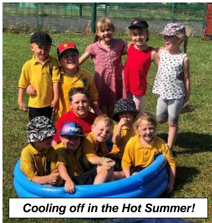
Cooling off in the Hot Summer!

The strategy is to continue to build reserves through normal revenue surpluses, to enable us to consider future plans for the Project, including an increase in session provision, and build reserves for any future expenditure that may arise.