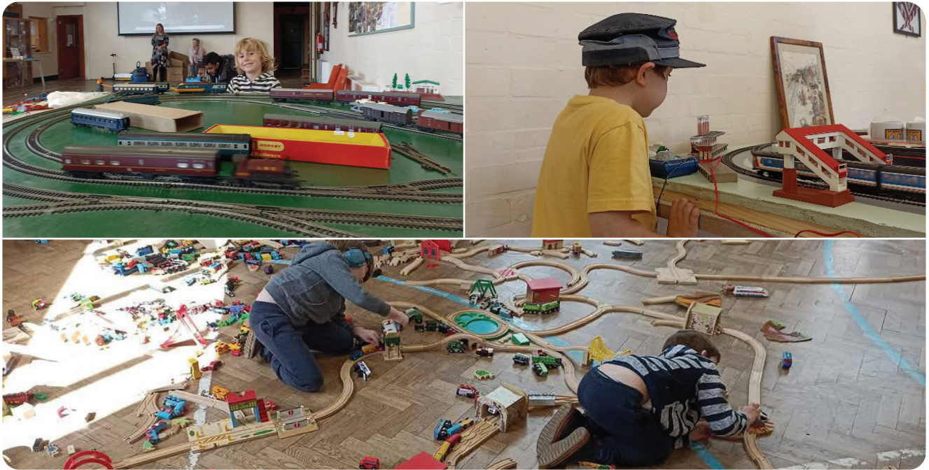
The Bromley Engine Shed group