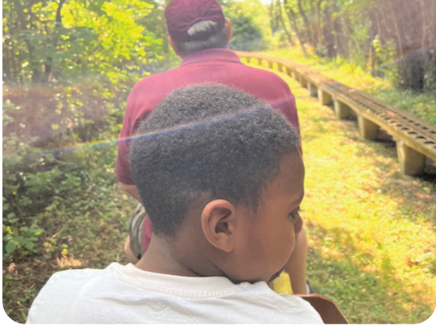
Enjoying the trains at High Wycombe Model Engineering Club