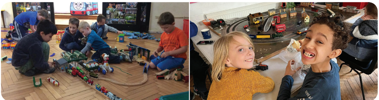
Play sessions at the Chingford group

We have welcomed lots of new families along this year, many of whom are on the pathway to a diagnosis appointment and are struggling to find suitable activities in the community. We want to ensure that they can benefit from a full range of activities at this early stage of the journey.