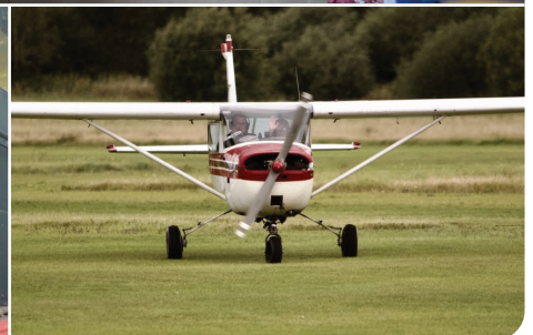
Images show Lady Judy McAlpine, our Patron, welcoming us at the Fawley Estate, with scenes from the day. The last photo shows the plane that members flew in as part of the PhaB day out.