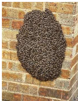
On a wall - April - early swarm!

Some of the swarms attended by our Members in 2024 - in every location imaginable!