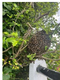
June - In a pub carpark