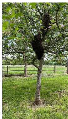
In a tree - early May - low but huge!