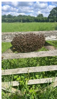
On a fence in a field - late May