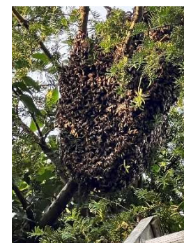
In a tree - July - 20 foot up! Ladder required