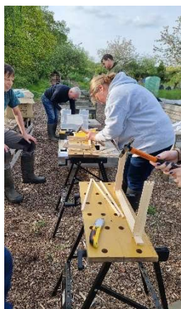
Beginners training in the new Hertford apiary

Equipment: We have an assortment of equipment which is free for Members to borrow. Our shared equipment includes an oxalic acid vaporiser, a wax melter for making candles, children's bee suits (sorry that I temporarily lost these), adult bee suits, manual 2 frame extractor and electric 12 frame extractor and a new uncapping tray with knife. Please feel free to ask!