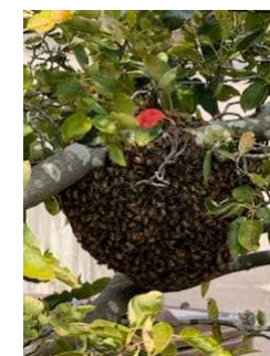
In a bush - August - late swarm