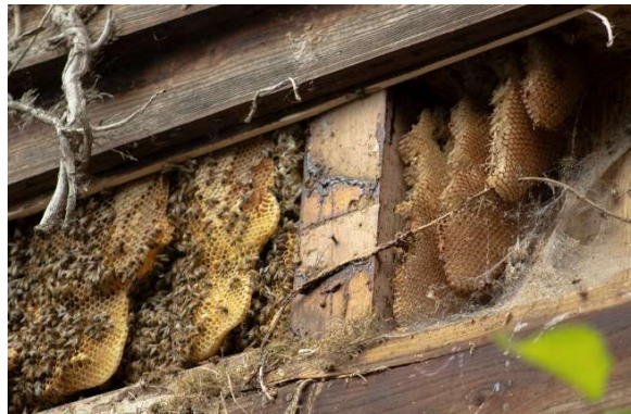
John clearing bees from the barn wall