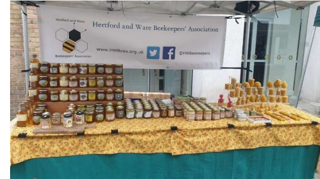
All set up at Hertford Farmer's Market

Apiary: We now just have one apiary in Essendon where we have some club hives which we use for training and also to provide honey which raises funds for the Association. If you'd like to keep bees there, please get in touch.